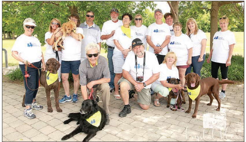
Participants in the June 10 fundraiser for the Grey-Bruce Animal Shelter at Stone Tree Golf and Fitness Club.