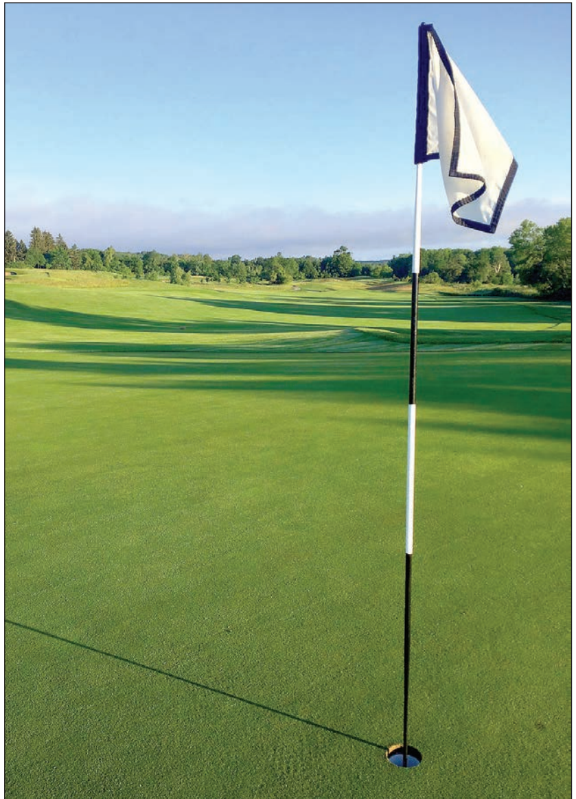
Batteaux Creek Golf Club will be the site of the Great Lakes Tour’s Collingwood Classic on July 12-13.