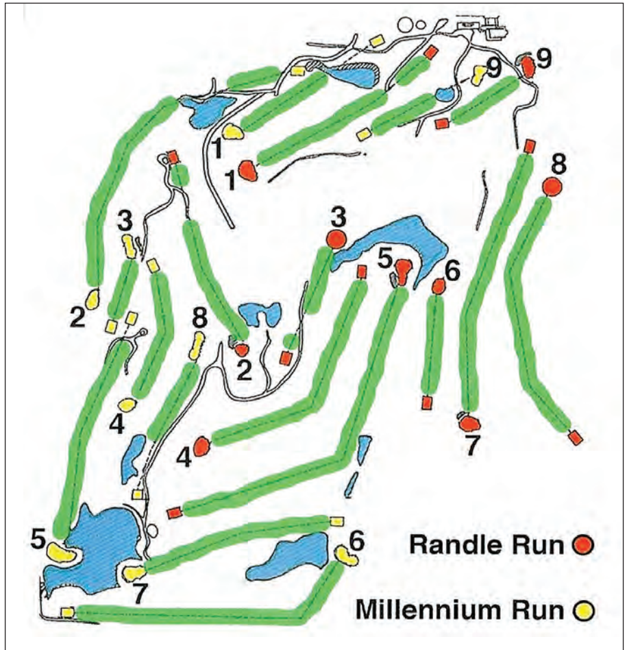
The new configuration at Meaford Golf Course.