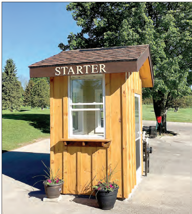
Legacy Ridge Golf Club has recently added a starter hut for use during the busy times.